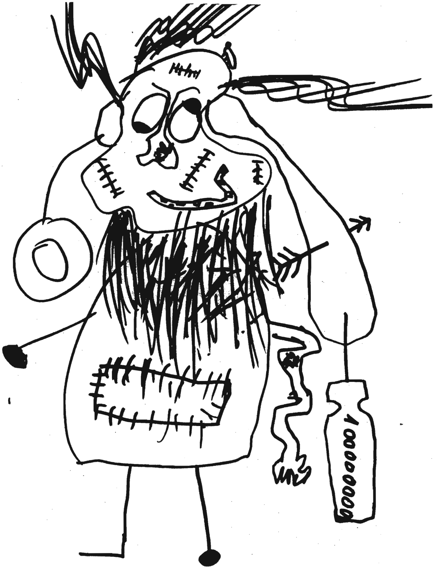
The author of this monster is one of my sons.